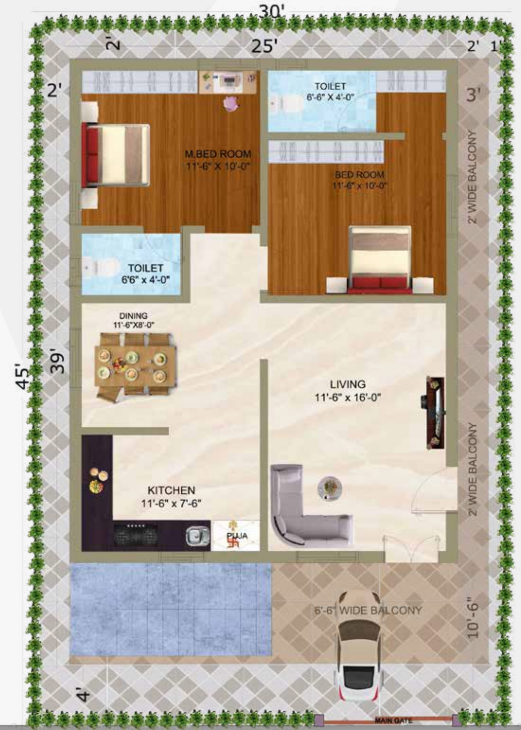
East Side Road