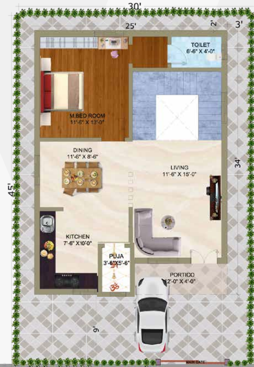
East Side Road LOWER LEVEL PLAN