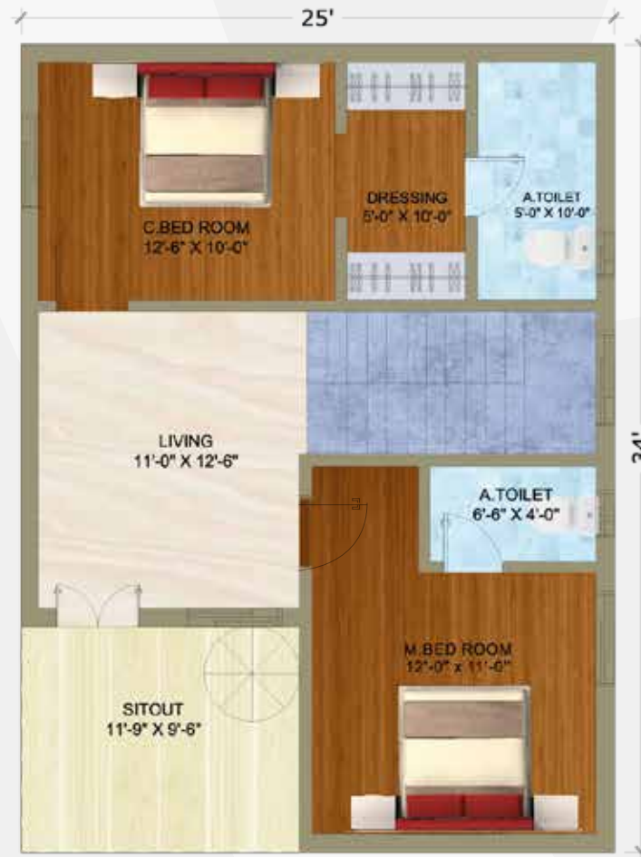
UPPER LEVEL-1 PLAN