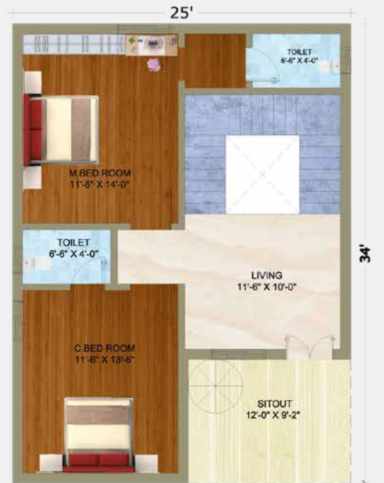
UPPER LEVEL-1 PLAN